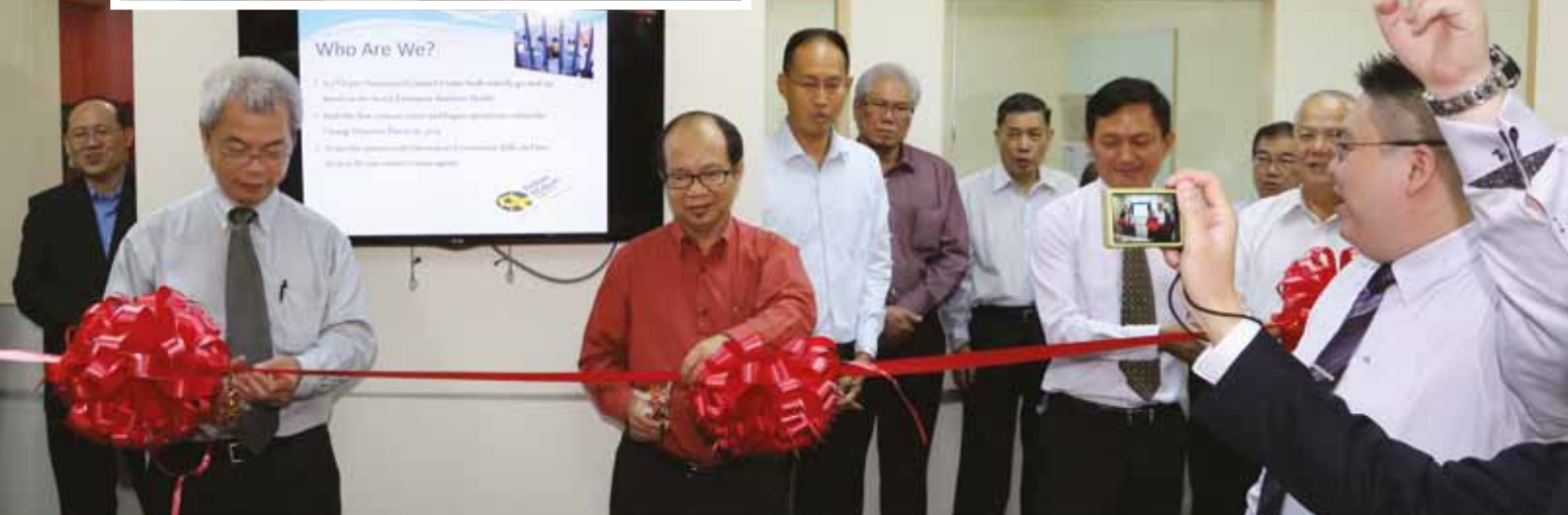
Connect Centre Directors, Directors & staff of Seacare Group and invited guests celebrating the CCPL's achievements