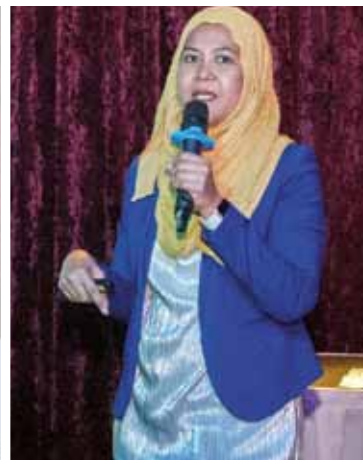
SOS officers presenting on the enhanced SOS welfare schemes to shipping companies and members of the maritime community

Under the improved SSS, shipping companies with Collective Bargaining Agreements (CBA) have received multi-purpose gift vouchers that entitle them to free accommodation at The Seacare Hotel and free accessibility to the hotel facilities for their training, workshop, seminar and corporate functions. In addition, they will also be presented with two complimentary Seminar Packages for the Maritime Hall per year. This is an expansion of the previous scheme, which saw the union giving out S$250,000 worth of hotel-only vouchers to CBA shipping companies on a yearly basis.